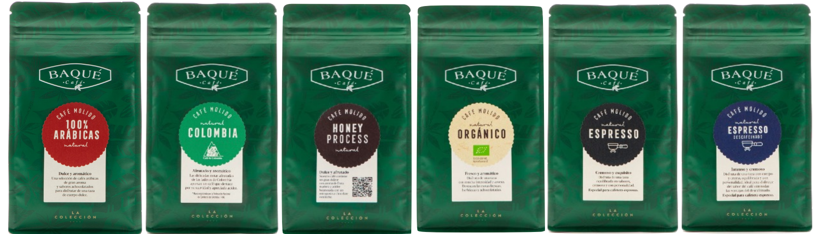
· 100% Arabica · Colombia · Honey Process · Organic · Espresso · Decaffeinated Espresso ·